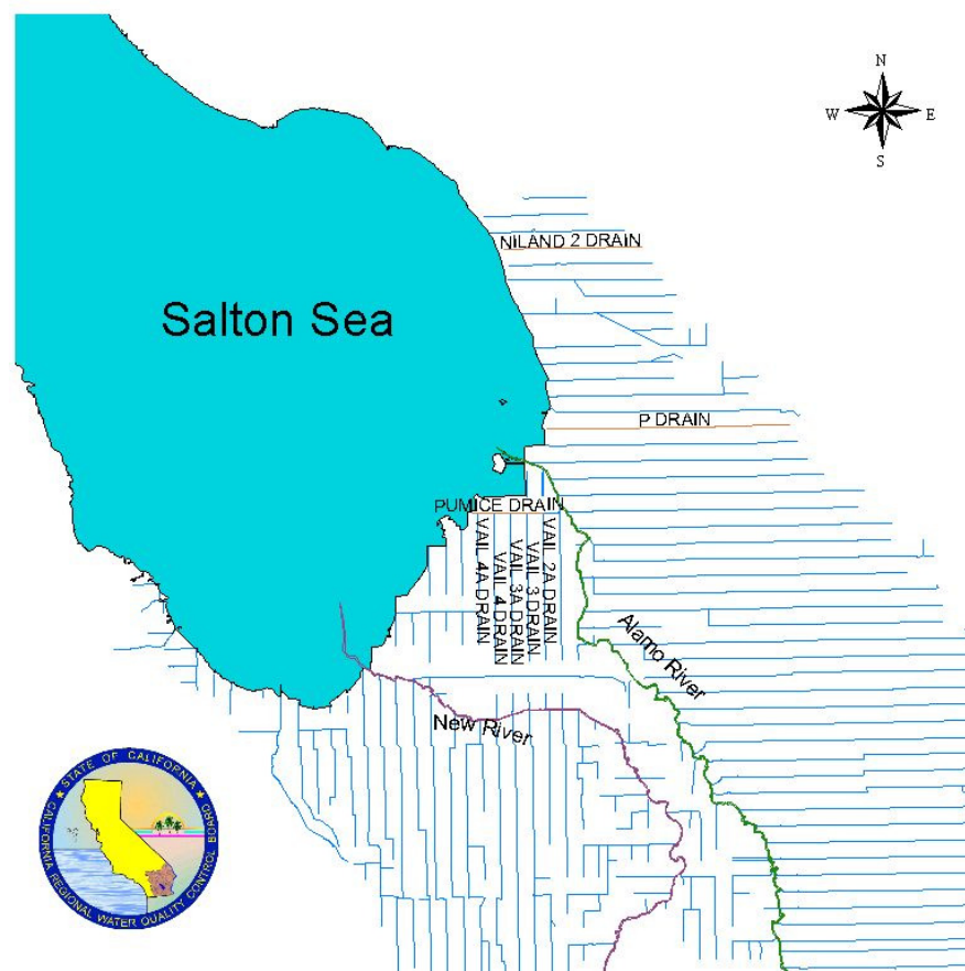
Table D-1: Imperial Valley Drains (Niland 2, P, and Pumice) Sedimentation/Siltation TMDL Elements